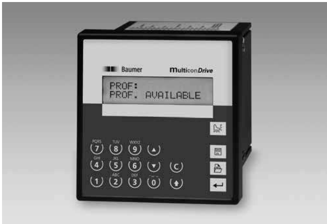
N 242 - Automated/manual format alignment